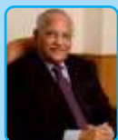
Dr. Prathap C Reddy Founder President & Emeritus Advisor