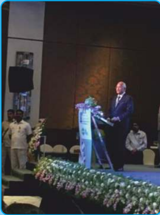
Dr. Prathap C Reddy , Chairman of Apollo Hospitals Group and Past President and Emeritus Advisor of GAPIO addressing the audience during inauguration ceremony.