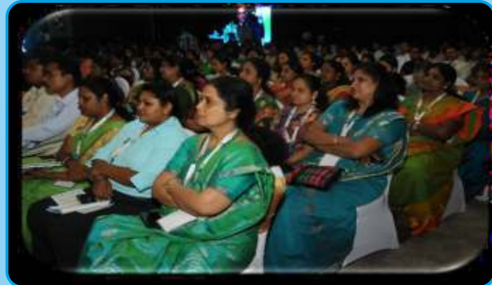
Delegates during the conference