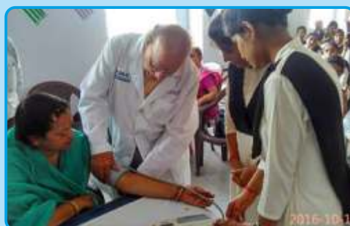
Training the volunteers to how to measure blood pressure and take blood samples for testing blood Sugar through Glucometer.