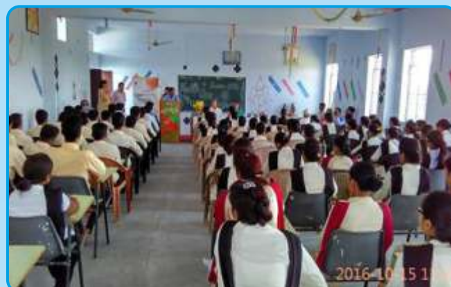
Awareness counselling regarding role of diet and lifestyle for preventing Diabetes, blood pressure and heart diseases.