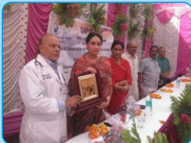
Princess Diya Kumari Ji of Jaipur inaugurating the camp.