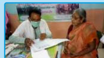
Check-up of Staff Member