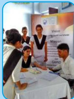
Blood Pressure Check