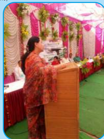
Princess Diya Kumari Ji of Jaipur addressing the gathering.

these camps were organized at Police Line, Saraswati Teachers Training College, Kusthala, Radha Kishan Teachers Training College, Thengala, Aggarwal Siksha Sansthan, P.H.C. Center, Chouth Ka Barwara, Chaudhary Mohalla and more than