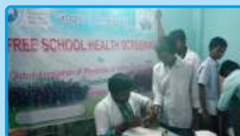
Blood Group testing