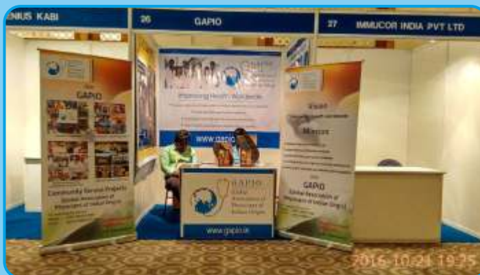
GAPIO Stall at VI International Patient Safety Congress