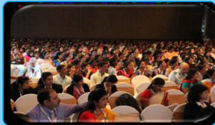
Audience during evening function