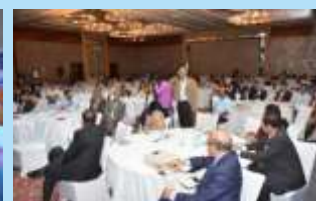
Delegates attending the Session