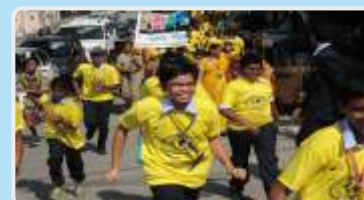
First GAPIO School event in India on 4th September, 2015