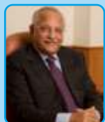
Dr. Prathap C Reddy Founder President & Emeritus Advisor