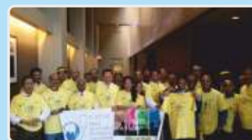
GAPIO Obesity Walk Medical Alumni Meeting in Dallas on Oct 24, 2015