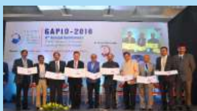
Official launch of Special Postal Cover of GAPIO by Chief Postmaster General and distinguished chief guests