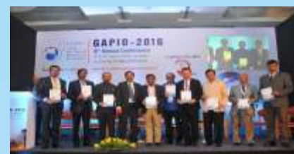
Launch of souvenir by the Chief Guest and GAPIO office Bearers