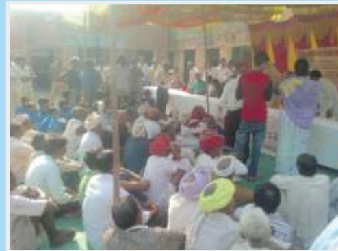
Registration of patients