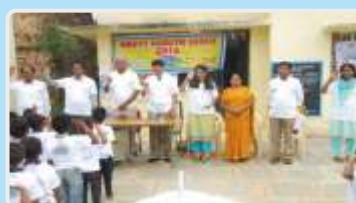
Second GAPIO School event in India on 12 September 2015