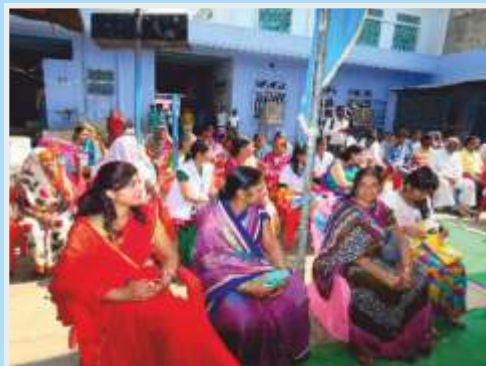
Patients waiting to get examined

Free Medical Health Check-up camps were organised by Global Association of Physicians of Indian Origin (GAPIO) in collaboration with Global Health and education on 25th October 2015 at Halonda, on 31st October at Sawaimadhopur and on 2nd November 2015 at Sherpur, Rajasthan.