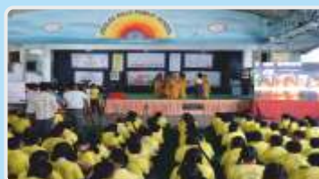
First GAPIO Pilot Program in India on 4th September, 2015

Distribution of snack packets to all the participants.