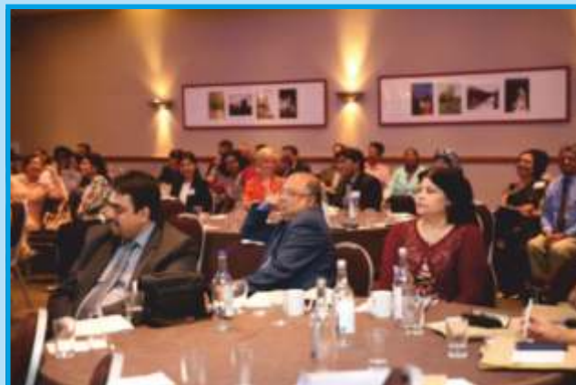
Delegates attending the session