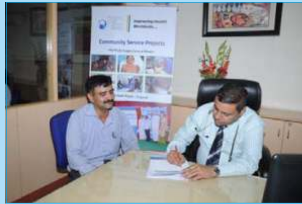
ECG Test being conducted by technician Doctor Examining the patient