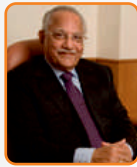
Dr. Prathap C Reddy Founder President & Emeritus Advisor