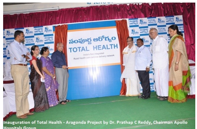
Inauguration of Total Health - Aragonda Project by Dr. Prathap C Reddy, Chairman Apollo Hospitals Group